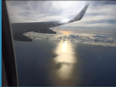
Flight to Spain