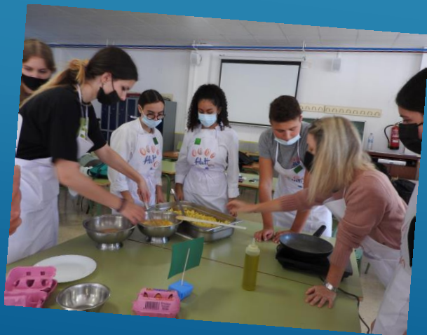
-cooking typical/famous spanish meals